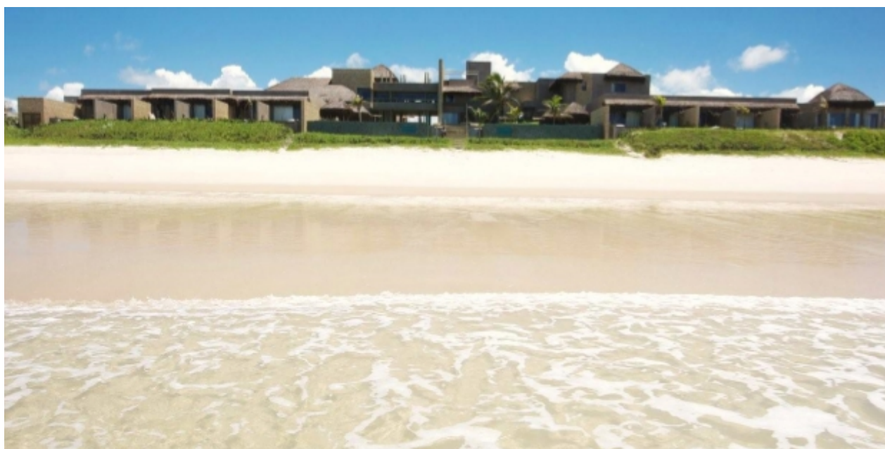
Barra de São Miguel, Alagoas, Brazil.