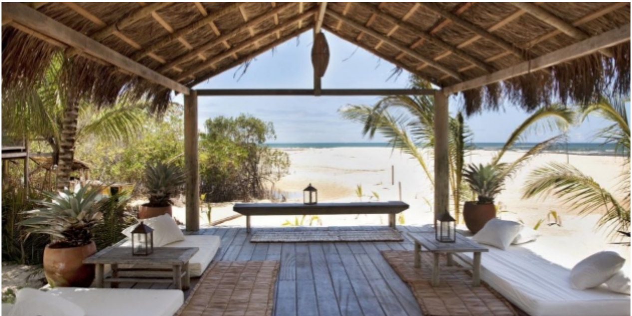
Trancoso, Bahia, Brazil.