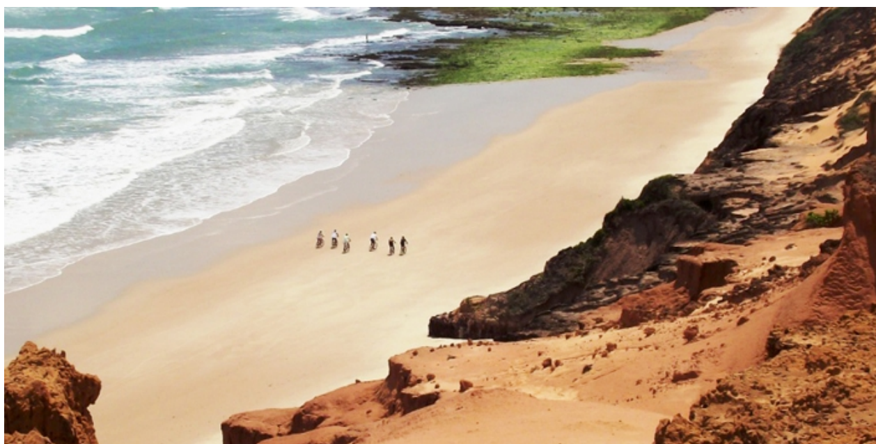
Pipa Beach, Tibau do Sul, Rio Grande do Norte, Brazil – 4 days.